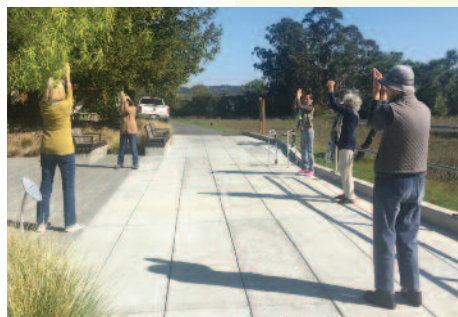
The Redwoods’ residents exercising with social distancing near the marsh.

While the Coronavirus disruption presents many uncertainties, and requires temporary curtailment of our “open campus” lifestyle, we are confident that the strength of our residents, and the support of our surrounding community, will help us continue to thrive.