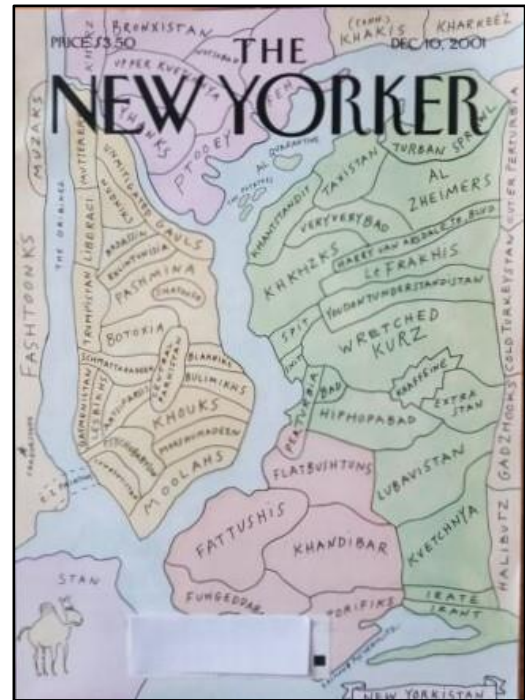
Cover title: New Yorkistan Artist: Kalman A. Meyerowitz Dec. 10, 2001, issue

➤ No one submitted a favorite New Yorker cartoon, but here's an anonymous submission of a favorite New Yorker cover.