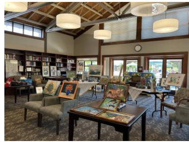
Welcome to the Boutique