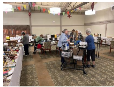
Setting Up – Lots of Work!