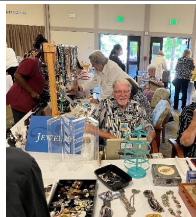
Another Sale Brings a Smile