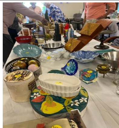
One Person's Treasure.....