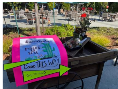
Where are the Plants?